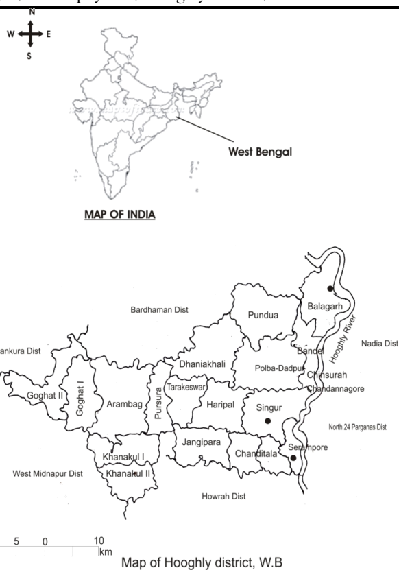
Fig. 1 ● Indicates study sites

Algal materials had been collected in sterilized glass containers from ponds of different places viz. Khamargachi (23.05°N, 88.43°E), Kamarkundu (22.83°N, 88.20°E) and Rishra (22.71°N, 88.35°E) of Hooghly district, West Bengal (Fig.1). Detailed study was made by examining specimens under Olympus microscope (Model-CH20i) for identification of species. Samples were preserved in 4% formalin. Identification of taxa was accomplished with the help of authentic literatures [5, 7, 10, 11, 13].