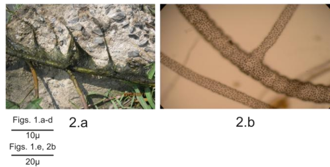
Plate-1: Figs. 1. a-d Compsopogon coeruleus (Balbis) Montagne thallus showing main axis with a branch, a basal part. 1. d, a mature branch.